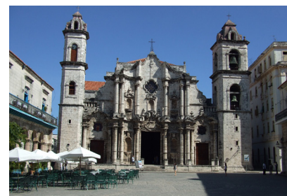
HAVANA CATHEDRAL BY HAYDN BLACKKEY