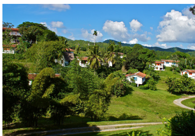
LAS TERRAZAS BY KATE PEREZ