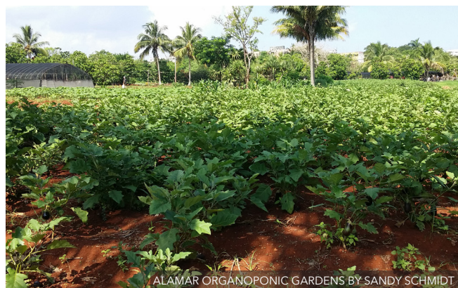
ALAMAR ORGANOPONIC GARDENS